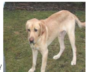
Meet Gus, one of our current labs in foster care. Please visit our website to see Gus' story.