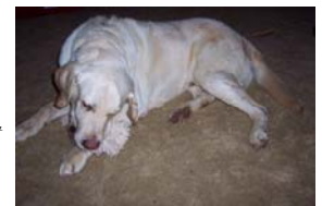
Meet Dante, another one of our labs in foster care. Dante should be available on the website shortly.